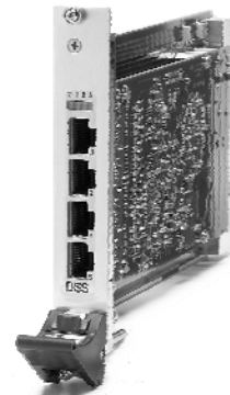
Model C5264-RJ 4-port