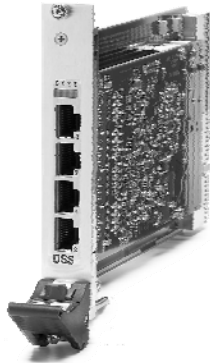
Model C5468 Gigabit Ethernet Switch with 2-port host interface