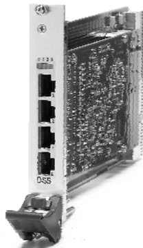
Model C5164-RJ 4-port